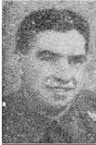
Batley News, 14 Oct 1944 (photo)